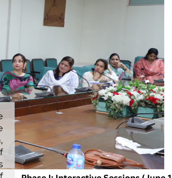
Phase I: Interactive Sessions (June 10-14, 2024)